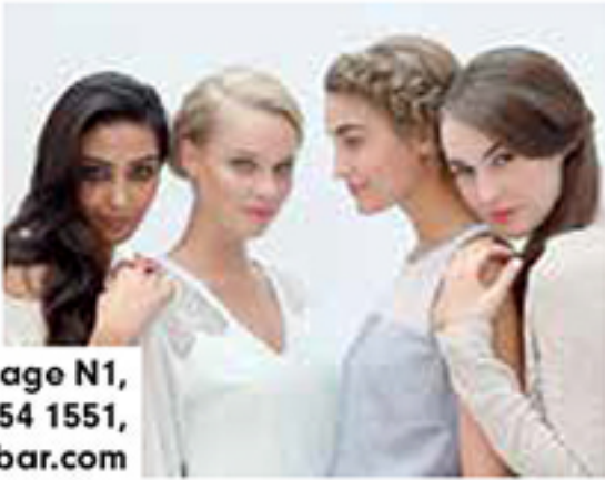
25 Camden Passage N1, 020 7354 1551, theblowbar.com

The Blow Bar's slogan tells you pretty much all you need to know: Walk In. Blow Out. Make Up. Nail It! On offer at Islington's BB are eight speedy blow-dry styles, from side-twisted pony tail to 1950s-inspired curls, all done in 30 minutes and costing £25 (or design your own for £45, which takes 45 minutes). As well as the blow dries, you can enjoy make-up courtesy of Lord & Berry (£20) and an express nail file and polish for £15. Really want to live that slogan? Go for a Triple Tipple – signature blow dry, make-up and nails – for £50.