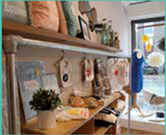
Anchor + Hope, 363 Roman Road E3, anchorandhopelondon.co.uk