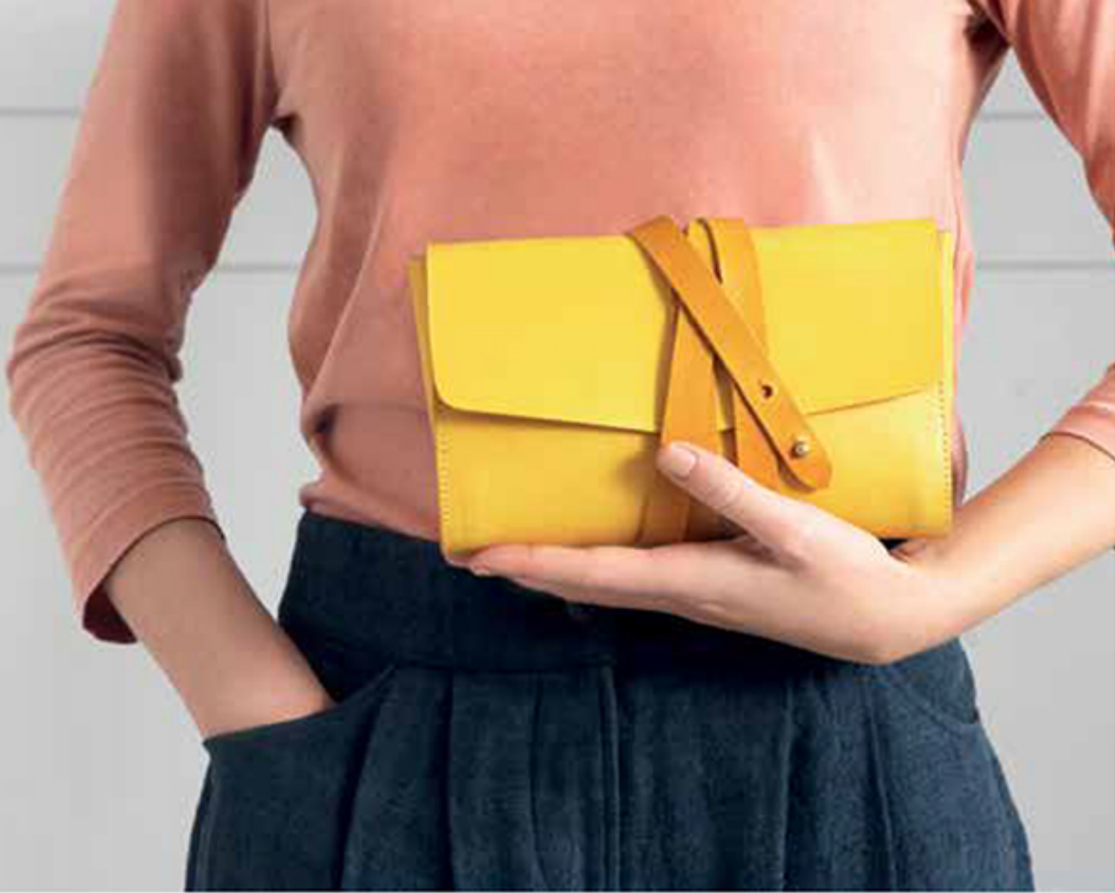
mhulot.co.uk Gia mini, also in black, £170; Garrard clutch, £155

Since its set-up in 2011, with its roots in classic leather craftsmanship and minimalist design, M. Hulot has built up a cult following to become the go-to for divine handbags and carry-alls. Perfect for summer is the new Gia mini, a compact cross-body style with beautiful curved edges, or stay classic with the brand's timeless Garrard clutch (right). Both carry the signature M. Hulot central strapping and come in seasonal shades of rosa/nude and yellow/mustard.