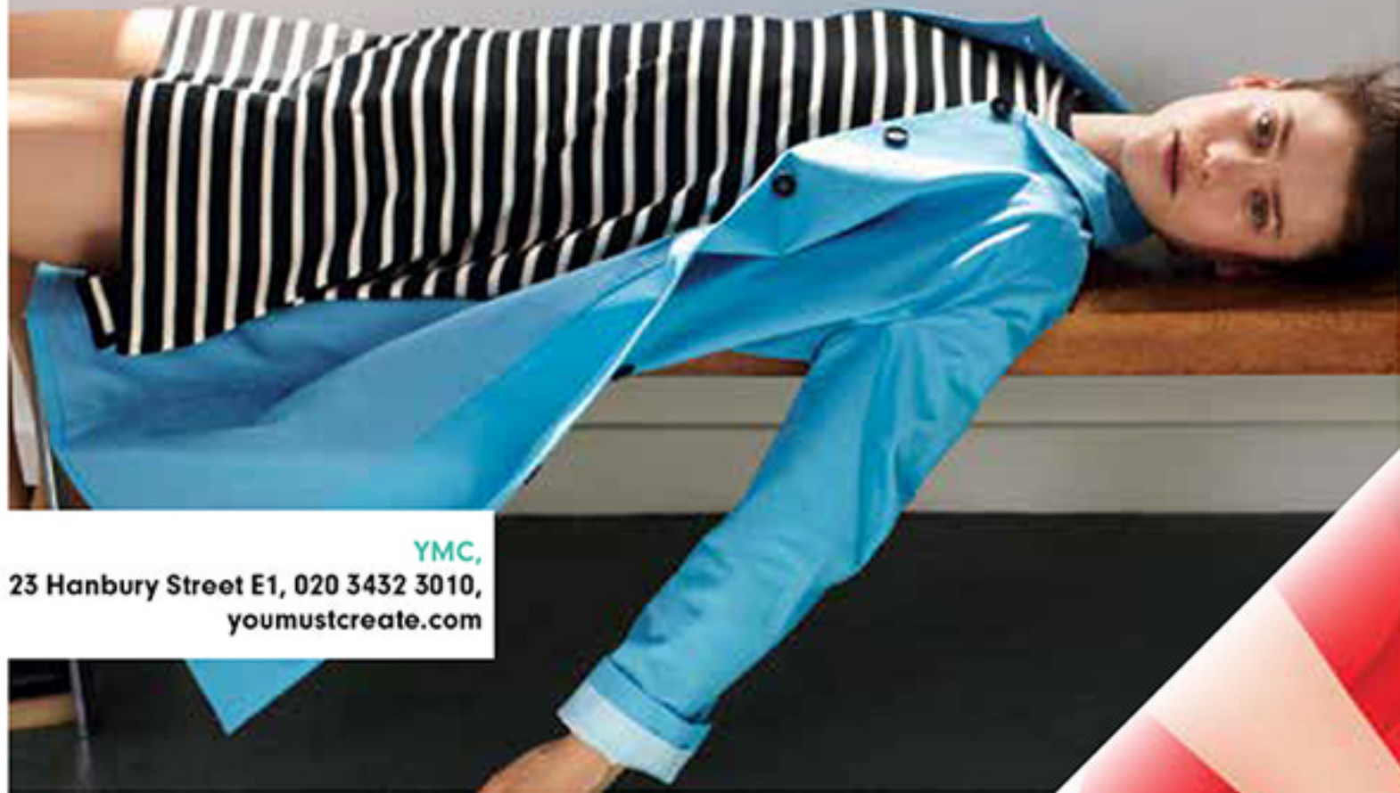
YMC, 23 Hanbury Street E1, 020 3432 3010, youmustcreate.com

The British label YMC has always done its own thing, and this season is no different. This Cocoon mac (£250) and Breton stripe dress (£120) have laid-back summer days and nights nailed. Beautifully made, in 100% cotton, they are a dream together, but statement enough to go it alone, and with a timeless quality that will stretch to autumn's first chill and beyond. Totally modern and not a 1970s vibe in sight.